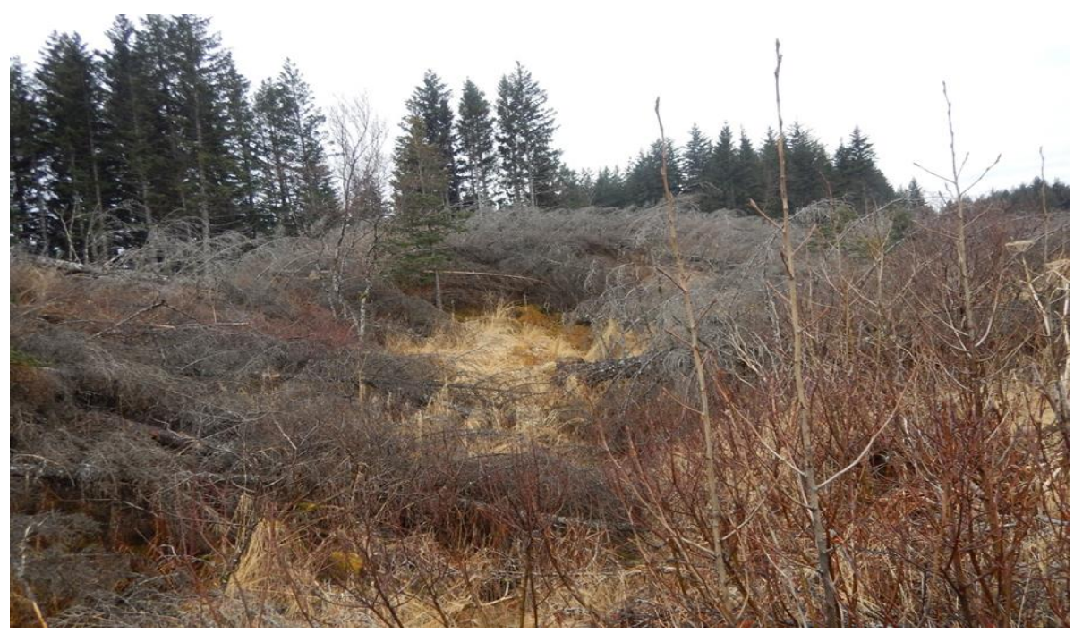
Figure 2. Felled timber covering the unnamed tributary.