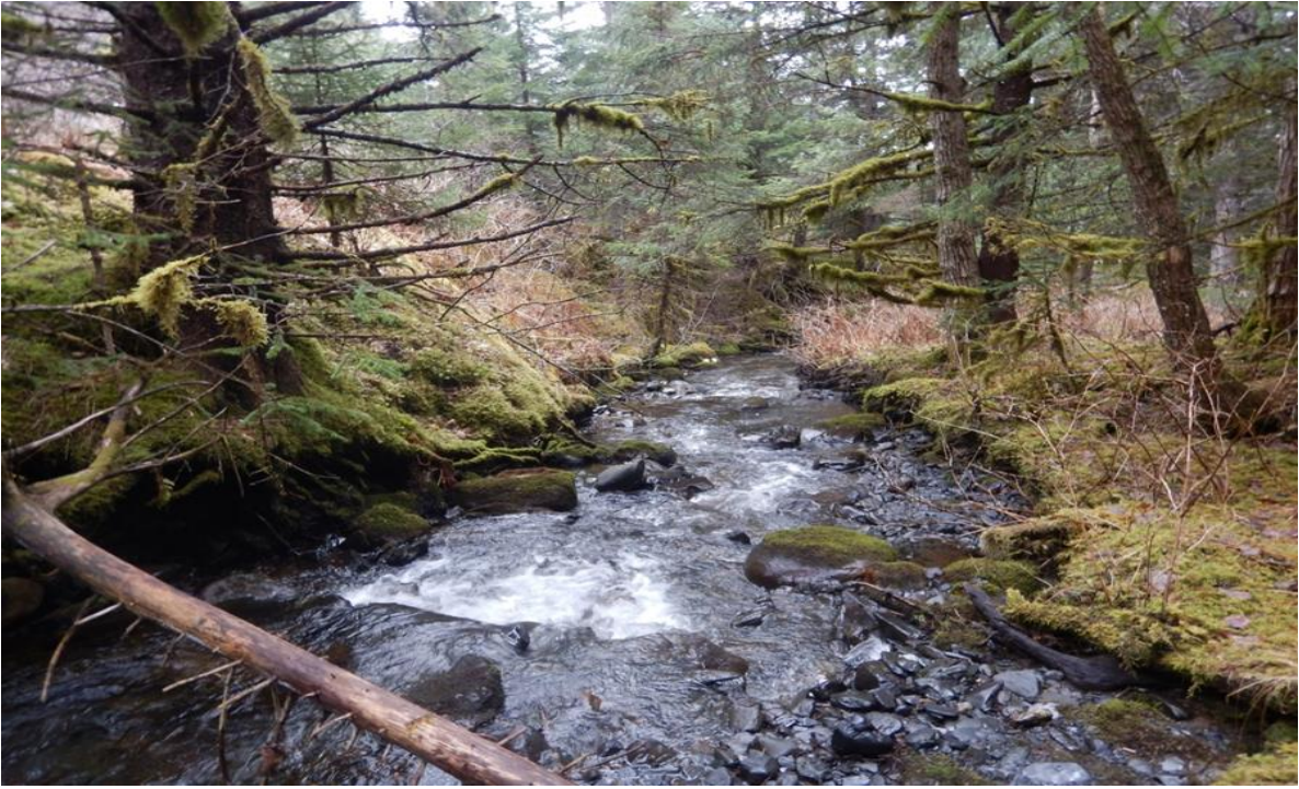
Figure 3. Airport Creek. View looking downstream.