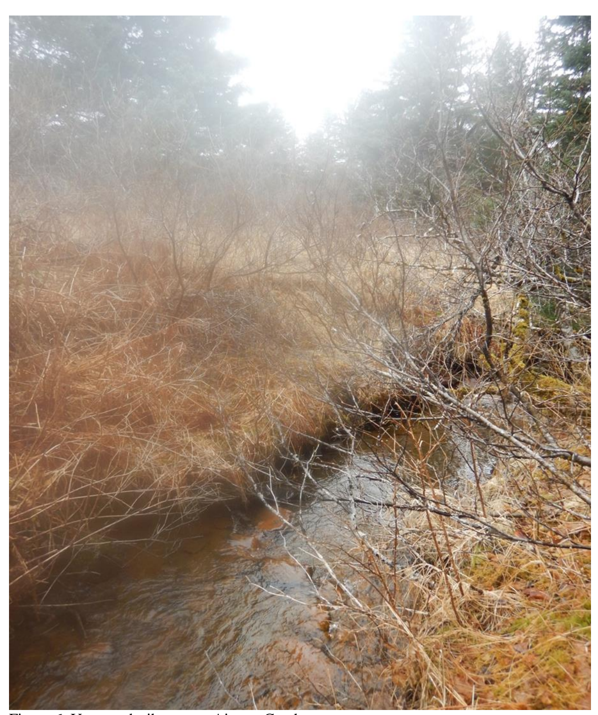
Figure 6. Unnamed tributary to Airport Creek.