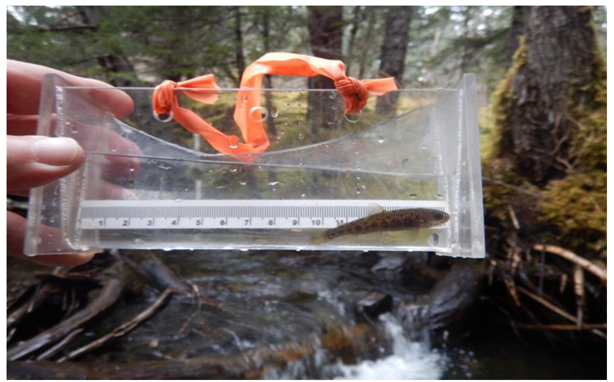
Figure 4. Dolly Varden captured in Airport Creek.